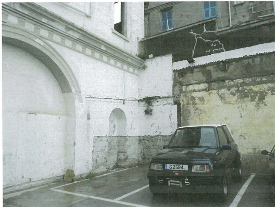
Intersection with Hospital Hill retaining wall